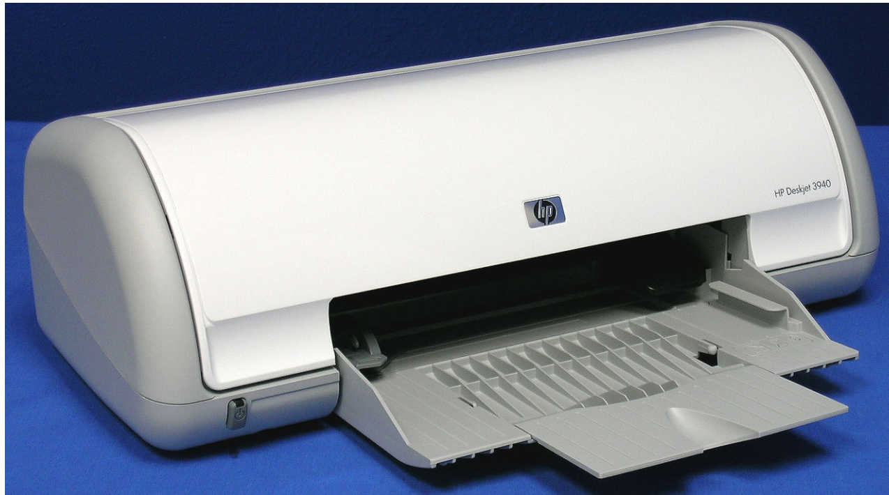
HP Deskjet 3940 Inkjet Printer